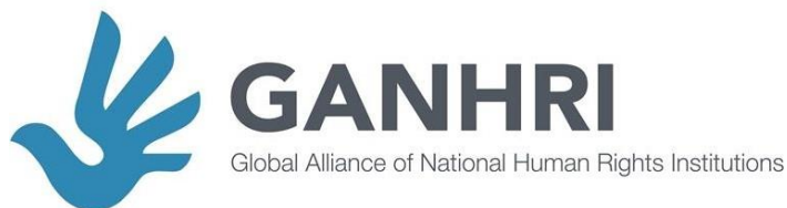
CHART OF THE STATUS OF NATIONAL INSTITUTIONS